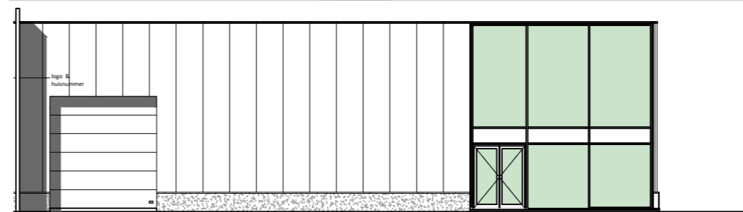
Dkt. sectionaal poort 4500 br x 4200 h