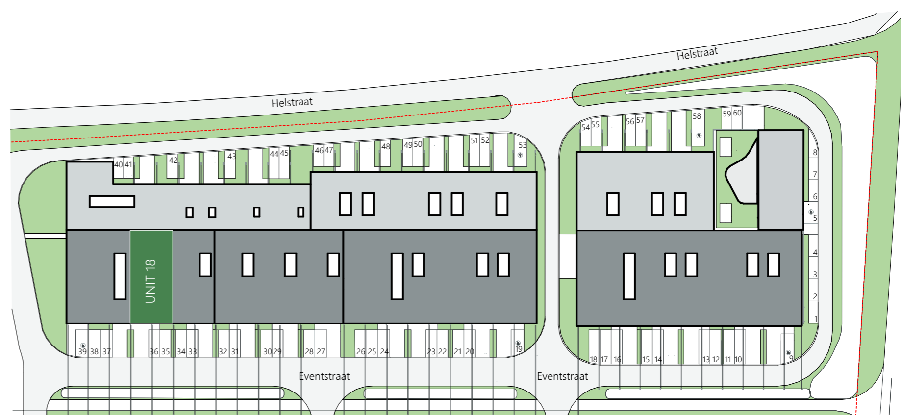
INPLANTING N 0 10 30m